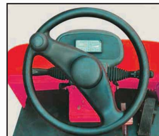
Adjustable steering column