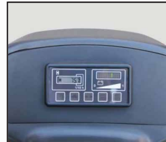
Multi function display

Meets or exceeds ASME B56.1 and CSA B335 Standards. Specifications are subject to change without notice.