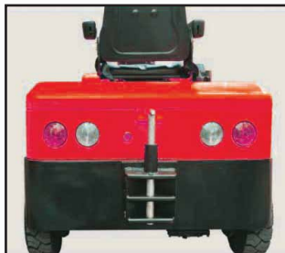
Back cover for easy service access