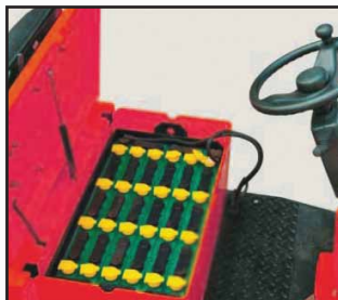
Large capacity batteries

Muscle like this usually makes a lot of noise, but the battery powered Muskel makes virtually no noise as it effortlessly moves materials from point A to point B in your distribution plant, factory or warehouse application.